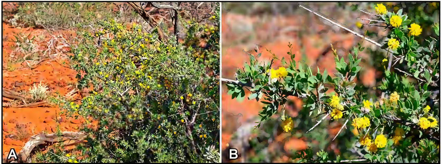
Figure 1. Acacia dilloniorum . A – habit showing intricate branching system; B – portion of branch showing pungent phyllodes on short, rigid, coarsely pungent branchlets, and globular heads.

is generally quite common in the places where it occurs. As of 2012, nine populations have been recorded, with four of these containing in excess of 2,500 individual plants. It seems likely that future survey will reveal additional populations because the range contains hitherto unsurveyed habitats that are similar to those from where the species is currently known. It is probably unlikely, however, that A. dilloniorum would occur outside the Weld Range. All known populations of A. dilloniorum occur on mineral exploration and mining tenements (at least two are on active mining tenements and several on exploration tenements). The above information regarding population details was provided by David Coultas (pers. comm., December 2013).